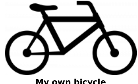
My own bicycle + ¥0