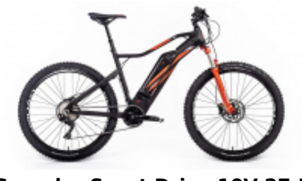
Graveler Sport Drive 10V 27,5 20.ETM.30 + 41.86.-