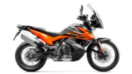
890 Adventure + ¥0