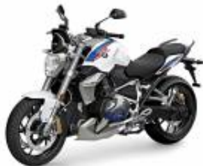
R 1250 R + $463.34