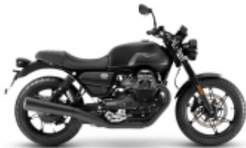
V7 Stone 800 + $0.00