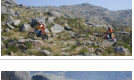
2 - Hotel FeelViana - Hotel FeelViana - 60-120km All-day tour with Professional Guide / Lunch en-route / Group dinner

3 - Hotel FeelViana - Hotel FeelViana - 60-120km All-day tour with Professional Guide / Lunch en-route / Group dinner