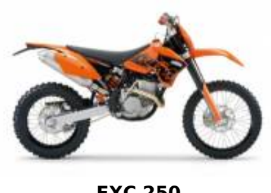
EXC 250 + $0.00