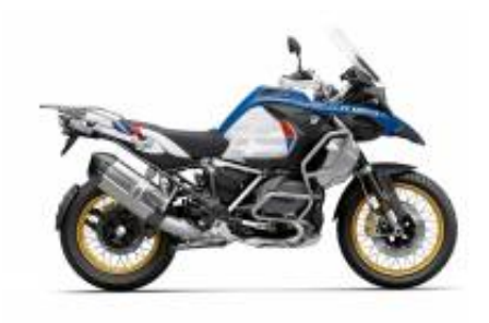
R 1250 GS Adv LC + $276.38