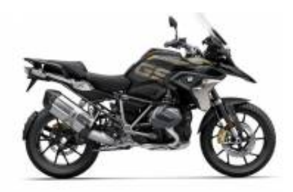
R 1250 GS LC + R$ 751,32