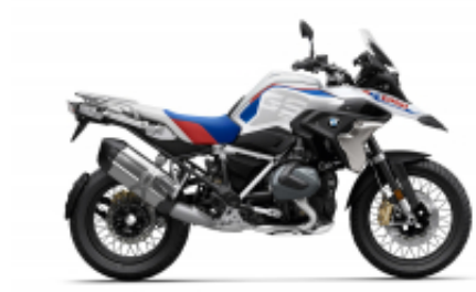
R 1250 GS + $507.46