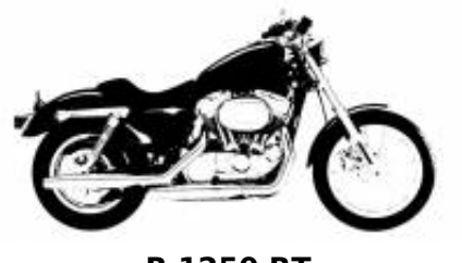
R 1250 RT + $507.46