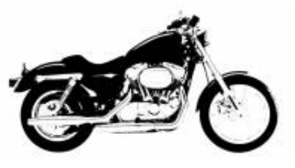
MT 07 700 + $0.00