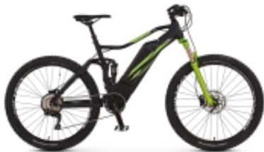
Graveller Sport Drive 10v 27,5 20.ETM.20 + $115.39