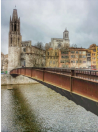
1 - Girona - Girona - 0