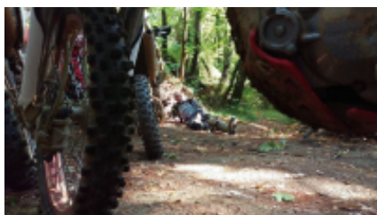
8 - Kardamili - Athen - 0