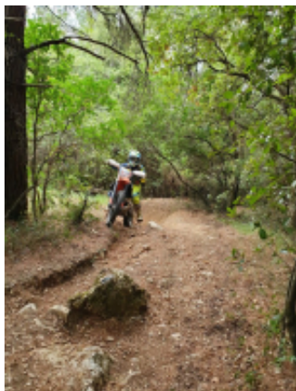
7 - Kardamili - Kardamili - 70