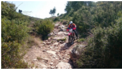
3 - Korinth - Nafplio - 110