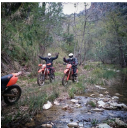
5 - Mystras - Mystras - 0