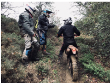
6 - Mystras - Kardamili - 130