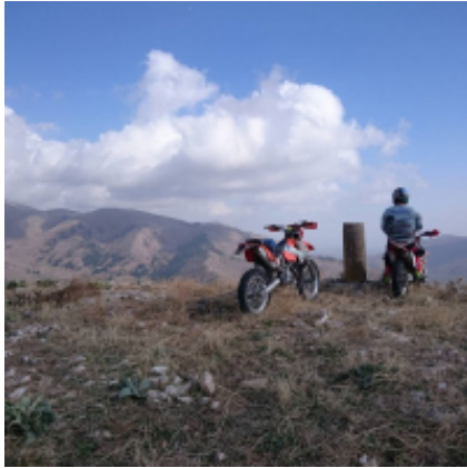
2 - Athen - Korinth - 140