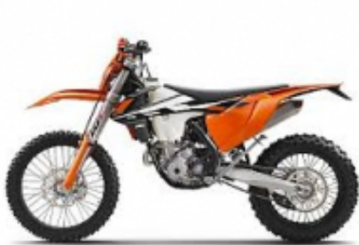
EXC 350 + $0.00