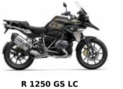
R 1250 GS LC + £0.00