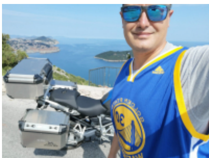
6 - Mostar - Dubrovnik - 190