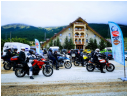
3 - Split - Blidinje Nature Park - 250