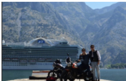
7 - Dubrovnik - Pelješac - 130