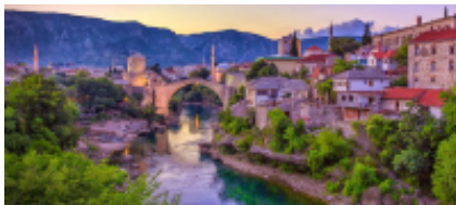
5 - Sarajevo - Mostar - 270