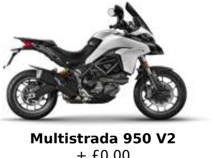
Multistrada 950 V2 + £0.00