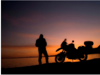
2 - Split - Hvar - 75