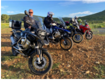
1 - Split - Hvar - 100