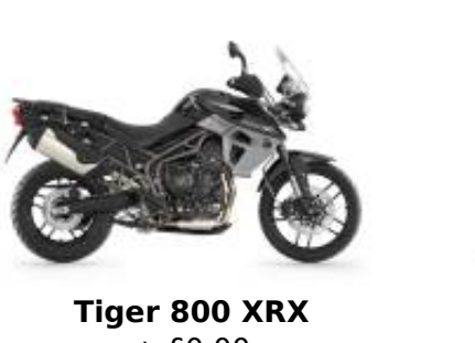
Tiger 800 XRX + £0.00