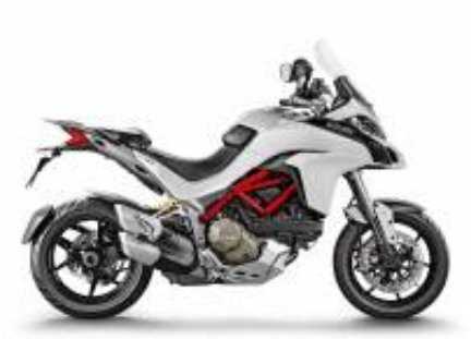
Multistrada 1260 V4 + £0.00