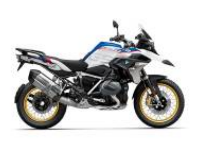
R 1250 GS HP Edition + £0.00