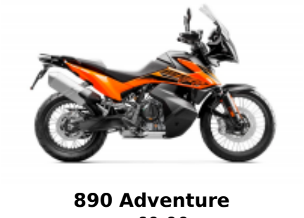
890 Adventure + £0.00