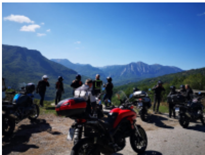
4 - Blidinje Nature Park - Sarajevo - 210