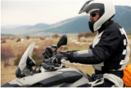
2 - Nafplio - Athen - 170