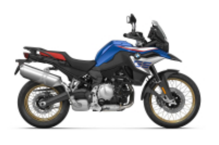
F 850 GS + $70.66