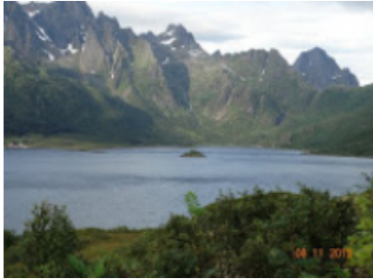
2 - Levi - Alta - 280