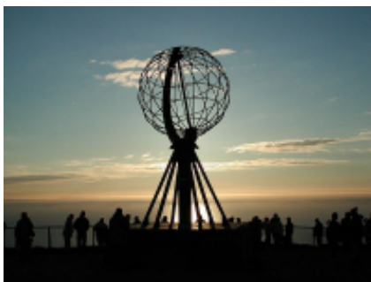
5 - Inari - Saariselkä - 300