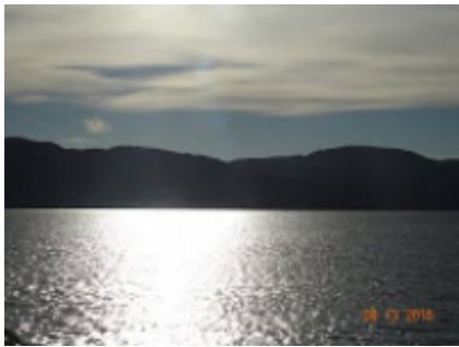
3 - Alta - Honningsvåg - 360