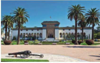
1 - Casablanca - Casablanca - 0 km