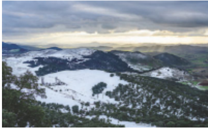
2 - Casablanca - Marrakesch - 240 km