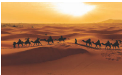
4 - Essaouira - Oualidia - 200 km