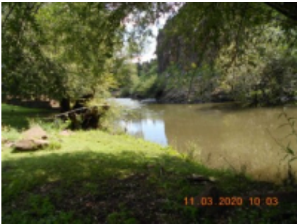
10 - Semonkong - Bethel -