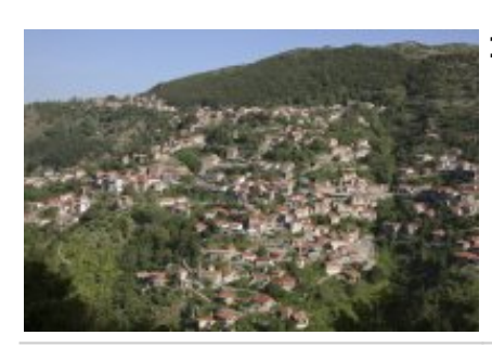
1 - GS Traveler Moto Rentals - Langadia - 200