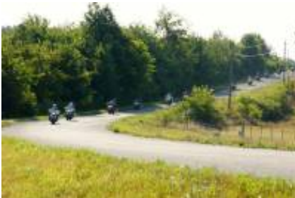
4 - Gallup - Grand Canyon - 452 km