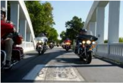
3 - Santa Fe - Gallup - 433 km