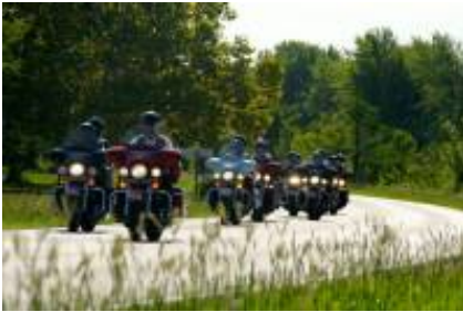
2 - Albuquerque - Santa Fe - 104 km