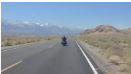
5 - Grand Canyon - Laughlin - 412 km