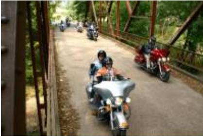
1 - - Albuquerque - 0