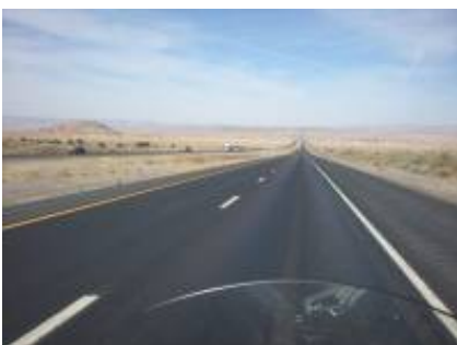
6 - Laughlin - Las Vegas - 206 km