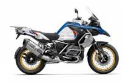
R 1250 GS Adv LC + $211.97