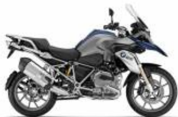
R 1200 GS + 270,64 €