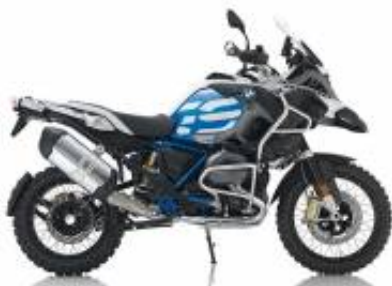
R 1200 GS Adv + £121.78