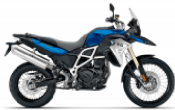
F 800 GS + £0.00