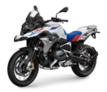
R 1250 GS Rally + R$ 18.276,07