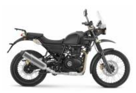
Himalayan 411 + $0.00