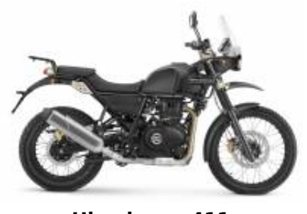
Himalayan 411 + $0.00