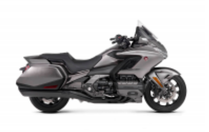
Goldwing DCT 2018 + $0.00