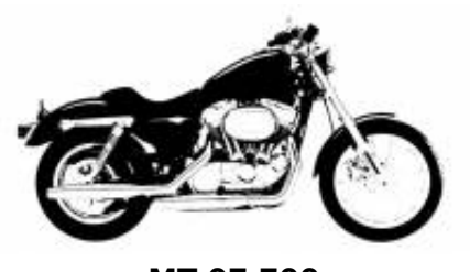
MT 07 700 + $0.00