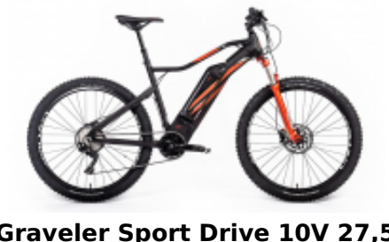
Graveler Sport Drive 10V 27,5 20.ETM.30 + $52.02