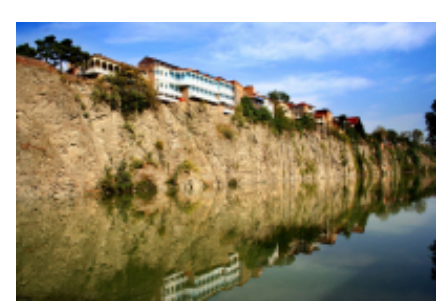
10 - Tbilissi - Tbilissi - 0 In the morning, departure to the airport for home.