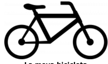
La meva bicicleta + R$ 0,00