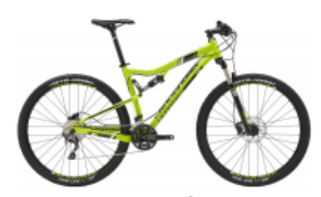
29" Rush 2 + R$ 202,14