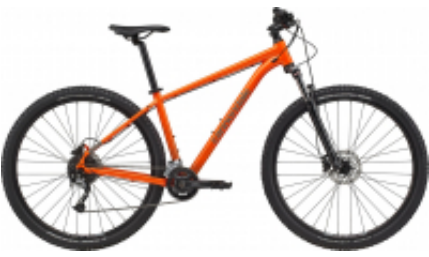
29" Trail 3 + R$ 151,61