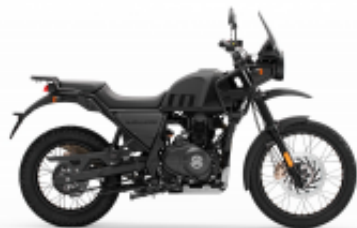
Himalayan 400 + $0.00