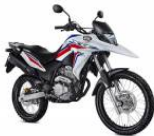
XRE 300 Rally + $0.00