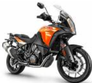
1290 Adventure S + $880.00