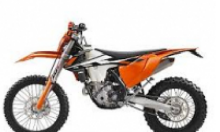
EXC 350 + 0.00.-