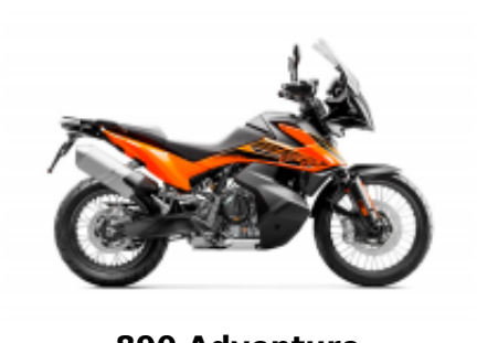
890 Adventure + $0.00