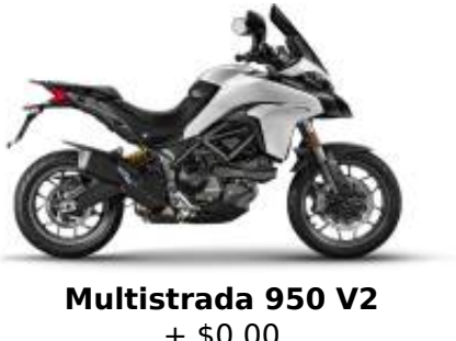
Multistrada 950 V2 + $0.00