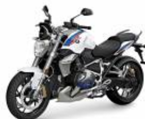
R 1250 R + $466.18