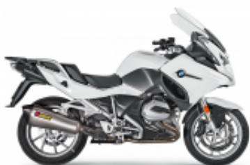
R 1200 RT + $466.18