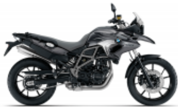
F 700 GS + 190,00 €