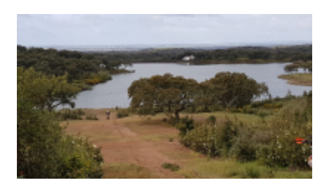
2 - Èvora - Èvora - 191 Évora - Monsaraz - Évora: 191 kms

Dinner will be held at the hotel and we will make an initial briefing related to safety standards and behavior during the Tour.