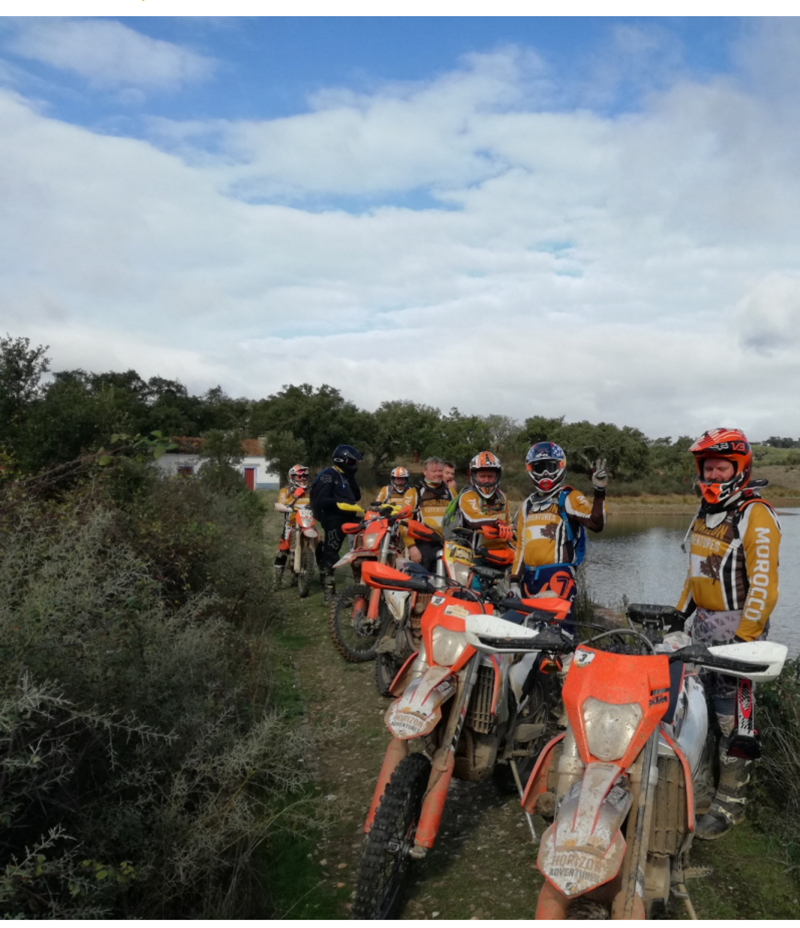
Motorcycle Enduro off Road tourepic Montargil, Enduro off Road Portugal