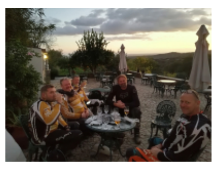
4 - Èvora - Èvora - 215