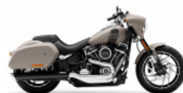
Sport Glide + $1,078.58