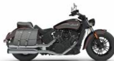
Scout Sixty + $1,078.58