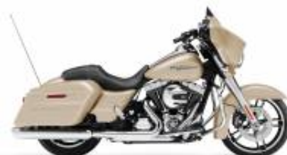
Street Glide Special + $1,078.58