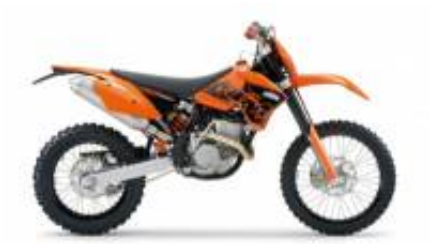
EXC 250 + $0.00