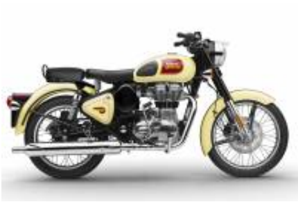
Classic 500 + 0.00.-