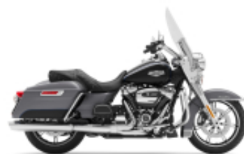
Road King Street Classic Class + $711.25