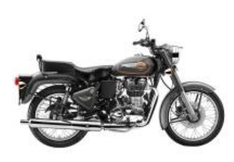
Bullet 500 + $57.80