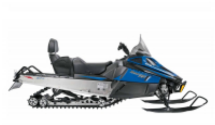
Bearcat XT + $0.00