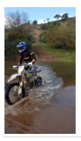
6 - Faro - Faro - 0 transfer to Faro airport.