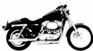
Street Glide GPS Incl. Street Touring Class + £0.00