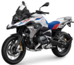
R 1250 GS Rally + R$ 15.148,39