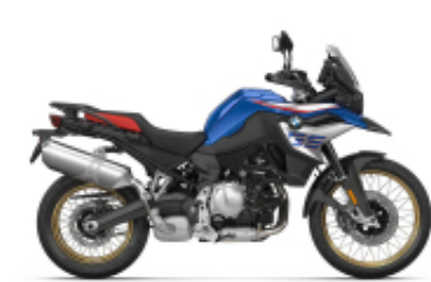
F 850 GS + R$ 12.284,20