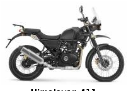
Himalayan 411 + $0.00