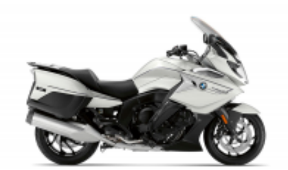
K 1600 GTL + $0.00