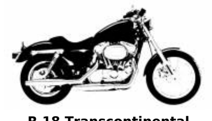
R 18 Transcontinental + $0.00