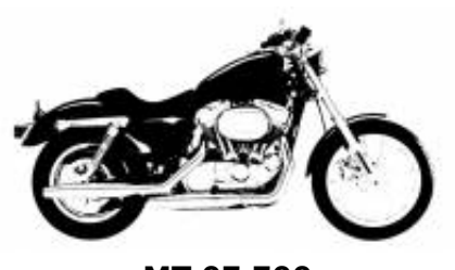
MT 07 700 + $0.00