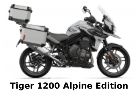
Tiger 1200 Alpine Edition + 1.947,21 €