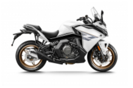
650GT + 1.019,42 €