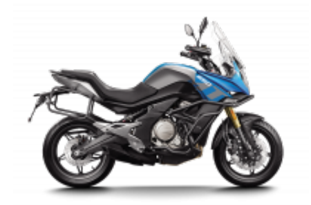
650MT 2022 + 1.019,42 €