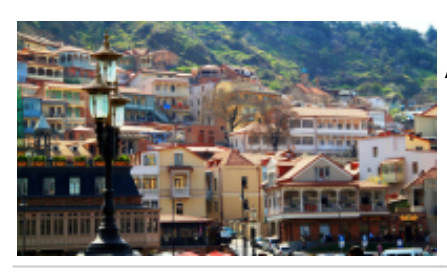
1 - Tbilisi - Tbilisi - 0

Arrival at Tbilisi International Airport and transfer to the hotel.