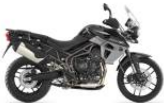
Tiger 800 XRX + £0.00