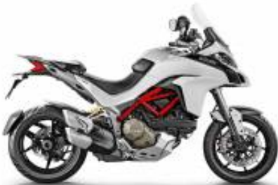
Multistrada 1260 V4 + £0.00