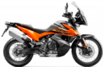
890 Adventure + £0.00