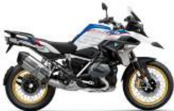
R 1250 GS HP Edition + £0.00