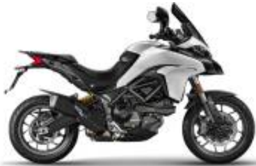
Multistrada 950 V2 + £0.00