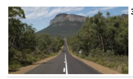
3 - Grampians - Highlands -