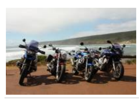
6 - Snowy Mountains - New South Wales -